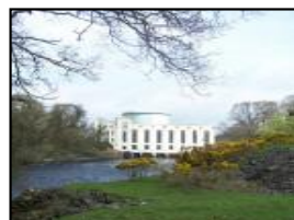
Tongland Power Station