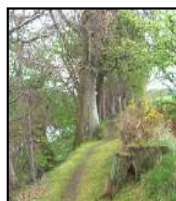
Wood by river