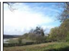
Dee Walk from road