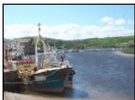
Fishing boat in harbour

The walk can be extended to Old Tongland Bridge, by crossing over the main road at the end of the Bridge, to a stile opposite. Continue on a grassy path near the river passing under the arch of the defunct railway bridge. Beyond the arch, follow the indistinct path through rough pasture leading up to a stile; and onto a path through woodland. The path is opposite the Power Station at this point. .