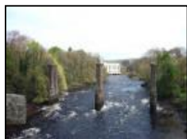
View from Tongland Bridge