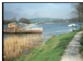
Near start of Dee Walk