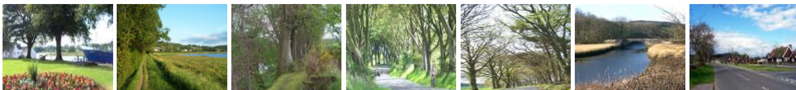
from Mote Brae