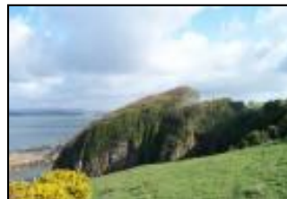
near Torrs Point