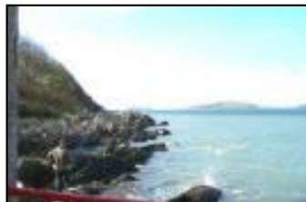
from Lifeboat Station slipway