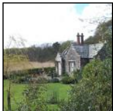
cottage at Sandside